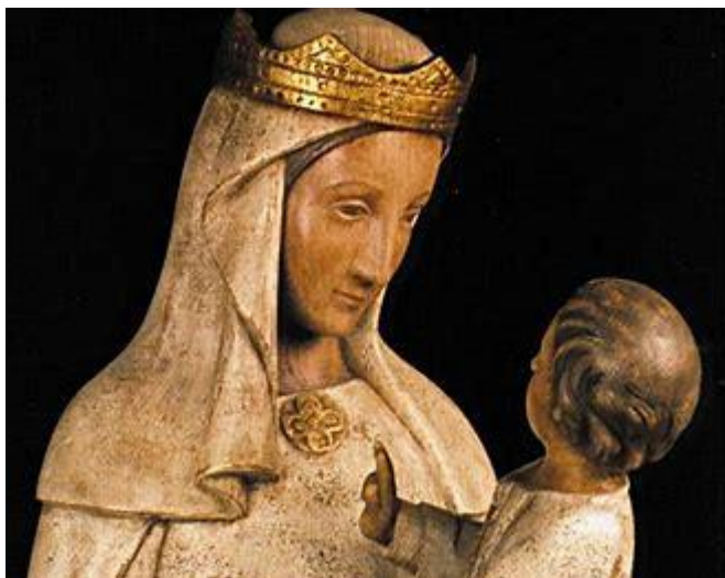
(The new statue of Our Lady at St Mary's Church)

“I want to encourage everyone to rediscover the beauty of praying the Rosary at home in the month of May.” -Pope Francis