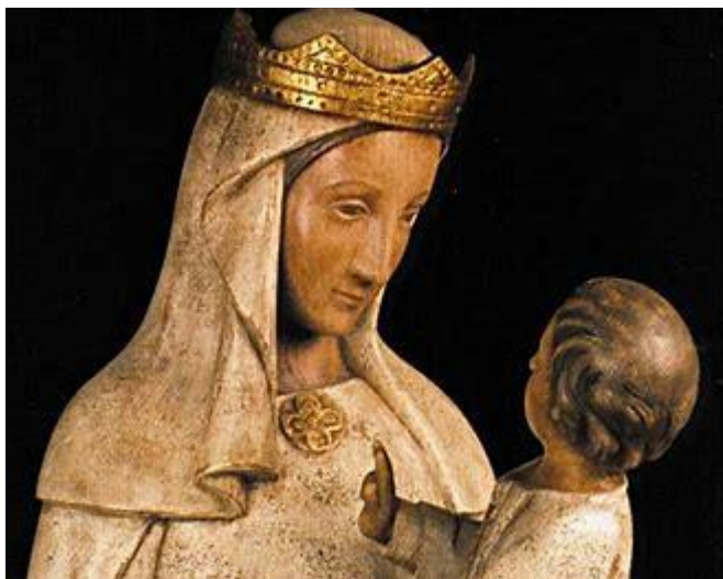
(The new statue of Our Lady at St Mary's Church)

“I want to encourage everyone to rediscover the beauty of praying the Rosary at home in the month of May.” -Pope Francis