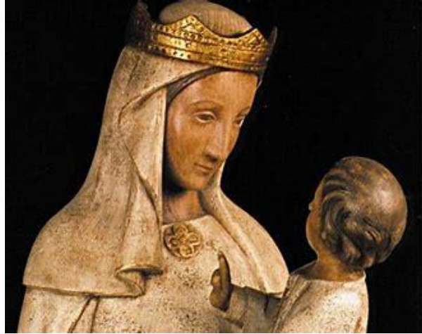
(The statue of Our Lady at Saint Mary's Church)

“I want to encourage everyone to rediscover the beauty of praying the Rosary at home in the month of May.” Pope Francis