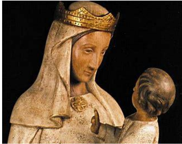
(The statue of Our Lady at Saint Mary's Church)

“I want to encourage everyone to rediscover the beauty of praying the Rosary at home in the month of May.” Pope Francis