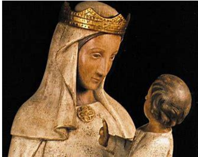
(The statue of Our Lady at Saint Mary's Church)

“I want to encourage everyone to rediscover the beauty of praying the Rosary at home in the month of May.” Pope Francis