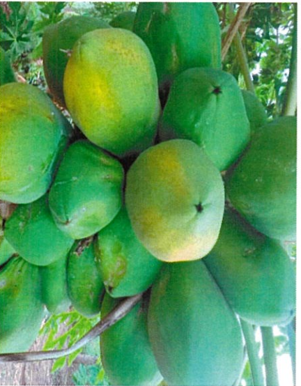
Below and right: Papawpaw harvest