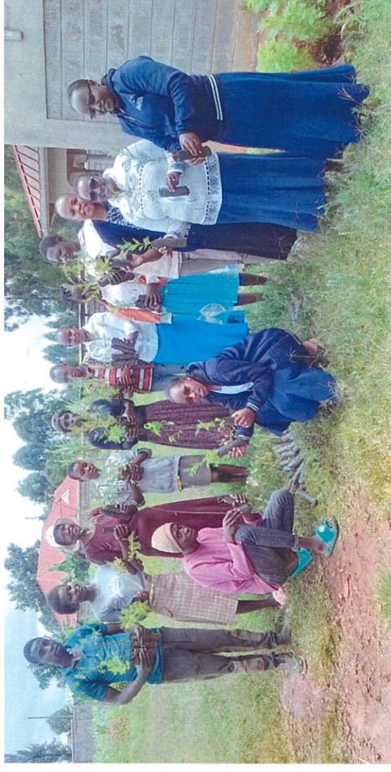
Above: Sisters distributing small trees to the community, to promote care of the environment