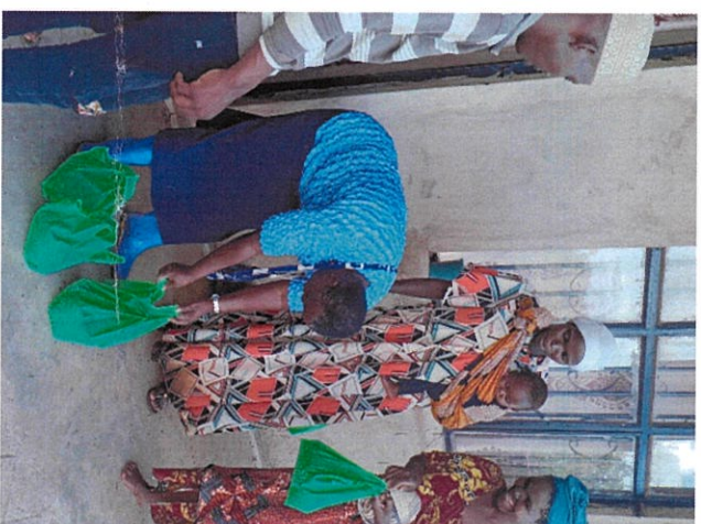
Above: Sisters support poor families by giving them food.