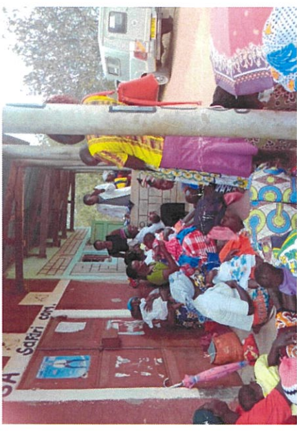
Above and left: Outreach activities offered through our dispensary in Mutito. Sisters take services to poor, remote villagers who live too far away to reach our health facilities.

Mutito Convent is situated in a very remote area. Here the Sisters run a health centre which is generally the only available means of medical help for the local communities. The health centre operates an outreach programme for remote groups. Various programmes include health education, maternity and outreach clinic services. The number of patients treated since January 2023 totals 5900.