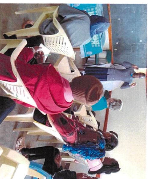
Above: Sr Emmaculate teaching our sponsored students on behaviour change