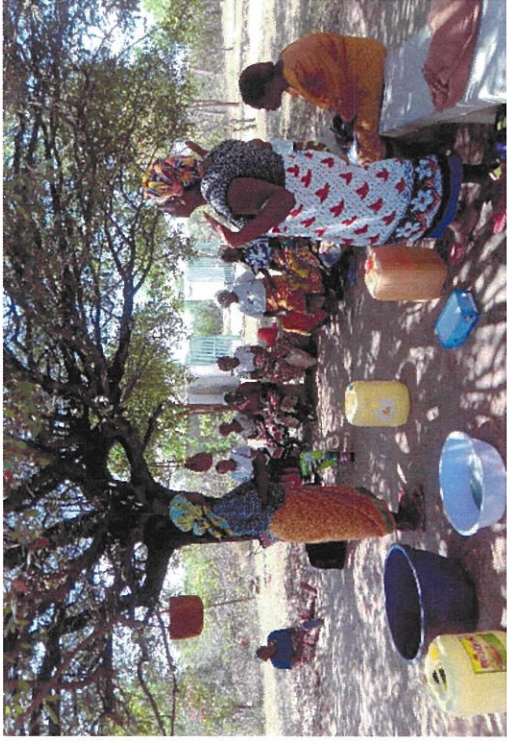
Left: Women's self-help group preparing to make soap to sell in order to generate income for their families.