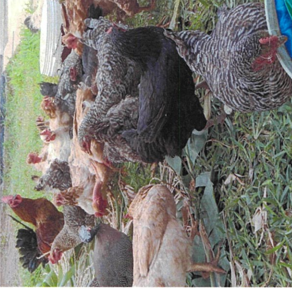
Above: Sisters are involved in chicken rearing as part of their agricultural activities to support poor.

In Sirende community, the Sisters are involved in pastoral ministry – teaching catechism, visiting the sick and poor within the parish and teaching in the local secondary school. The Sisters have worked hard to re-establish a connection with Creation, by holding agricultural exhibitions to help the local community set up kitchen gardens using recycled materials and planting trees.