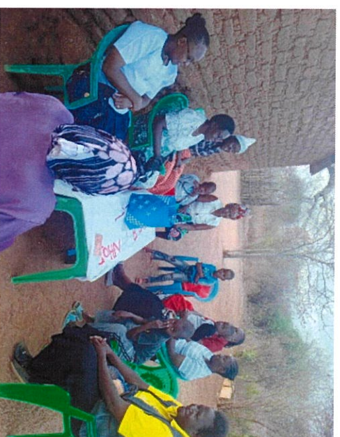
Left: Sisters with a gathering of Small Christian Community (SCC) members

St Monica's is our new convent which was opened on 27 th August 2023. The Sisters are involved mainly in pastoral ministry, teaching catechism, formation of members of small Christian communities and visiting the sick and poor, as we assess the needs of the area.