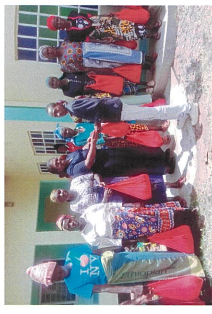
Above: Sr Anna sharing food with aged, HIV affected and infected families.

Mulutu Dispensary is located in a typically rural area, with limited job opportunities and households depend solely on subsistence agriculture. Mulutu Catholic Dispensary offers